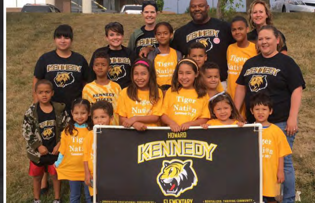
Year 2 Howard Kennedy Elementary's Reconstitution