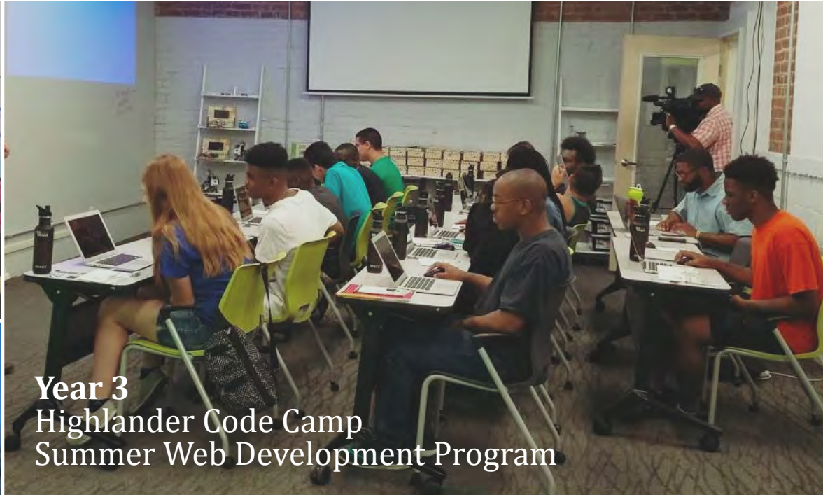
Year 3 Highlander Code Camp Summer Web Development Program